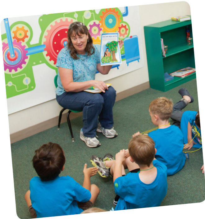
Session 2 Preschool

Eve looked at the fruit. It LOOKED good. She picked some fruit. It SMELLED good. She ATE some fruit—and she gave some fruit to Adam. He ate it, too! They had disobeyed God's ONE rule! (The Bible word for disobeying God is "sin.")